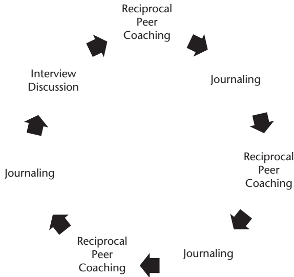
Figure 1. Repetitive Cycle of Individual Leadership Plan Implementation Support

outside their work environment. Training in coaching was provided by the program director (who has 35 years of experience in leadership development activities), included techniques of active listening with prompts for exploration, and was practiced in the classroom.